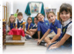
"Thank you for making my education possible!"

to make a difference in a child's life! Many of our families are struggling to provide a quality Catholic education for their children. You can help our kindergarteners by directing your state tax liability to Catholic Education Arizona